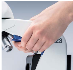
Ergonomic grip for easy carrying