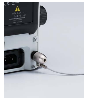
Built-in security slot