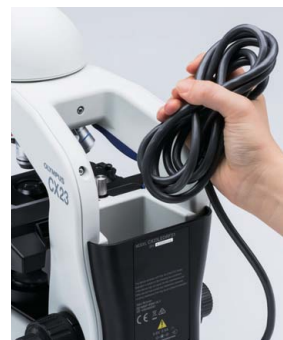
Cable storage compartment