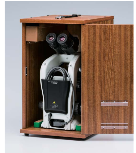
Dedicated wooden case (optional)