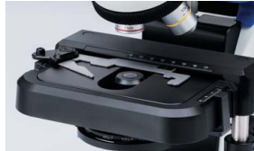
Rackless stage and stage cover