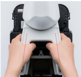
Angled arm enables comfortable carrying