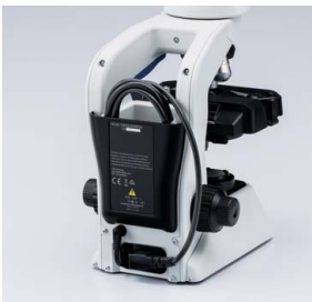
Convenient and easy access power cable storage