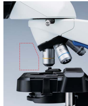
Inward-facing revolving nosepiece