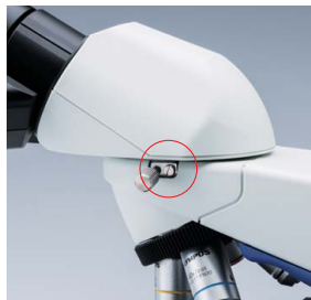
Locking pin for easy binocular rotation