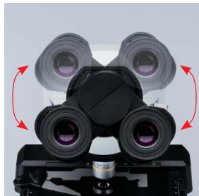
Eyepoint height adjustment